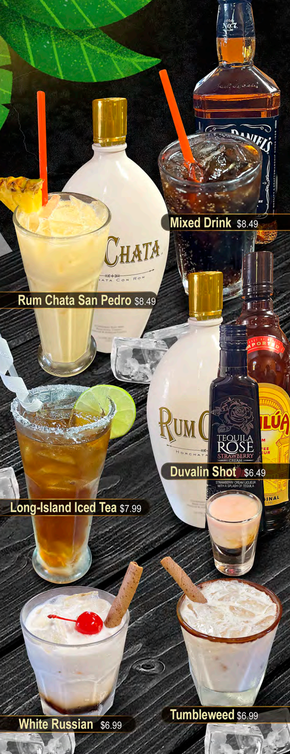
Mixed Drink $8.49